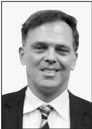
Randall A. Spencer

Once the Panel has decided that the requirements for a transfer have been satisfied, it must select the district to which the cases should be transferred. The statute is silent on the factors to be considered but the Panel has developed a substantial body of case law on the relevant factors: